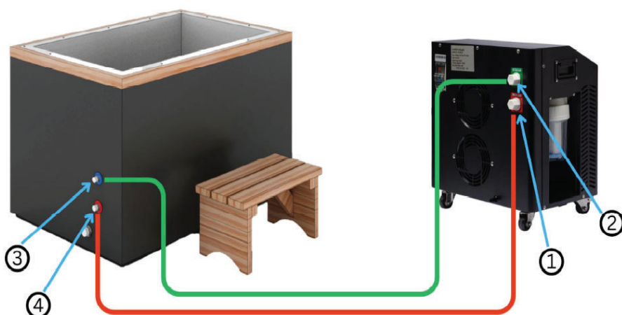
Cuboid Cold Plunge